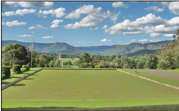
What a view for bowlers at the Kangaroo Valley Bowling Club in NSW They claim they have the best view in Australia, looking towards the Great Dividing Range.