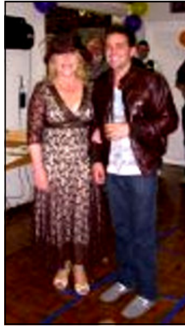
Our Fashion on the Field Winners.