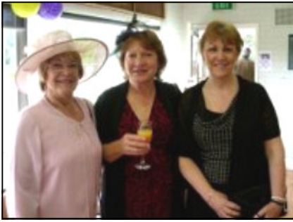
A chance to dress up...