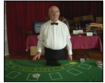
Put your 'Funny Money' down... see how fast you can lose it.